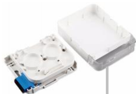
Transparent dust cover