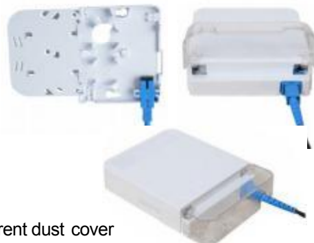
Transparent dust cover