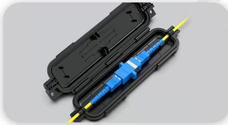
Fiber Rosette Box